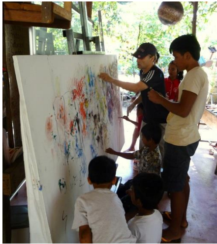
Beginning the 4' x 8' "Hearts of Cambodia" painting at ODA

At ODA I introduced the children to abstract art, expressionism, experimenting with various brush techniques, surface structuring using hands and other instruments, colour theory, using the subconscious creative mind.