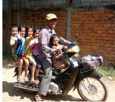
Grace House students riding home after a busy day at school