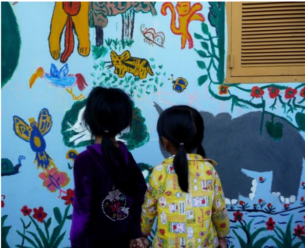
Studying the new Grace House mural