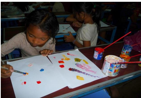
Learning about the colour wheel