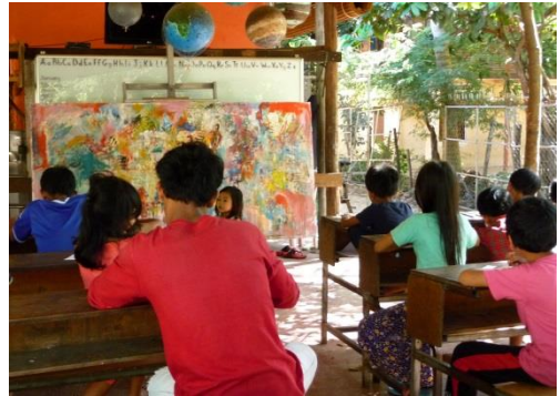
The ODA students, many are orphans