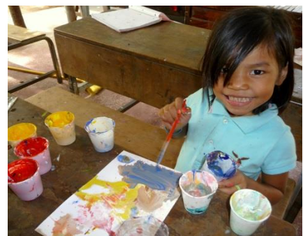
A future abstract expressionist