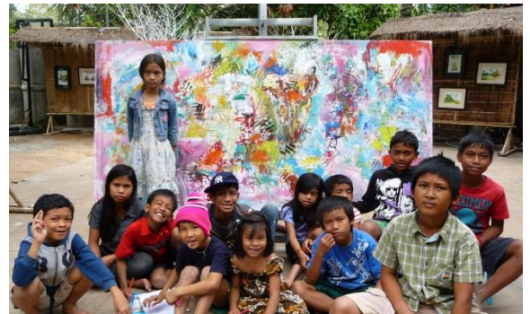
Progress with "Hearts of Cambodia" painting