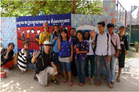
Students painting the school logo

Grace House Community Centre, a charity NGO "Enabling the community to become sustainable through education, family support and health care." I led several art projects including painting the office building with a colourful mural ("animals of Cambodia"), and the outside wall with the centre's logo. My stay included leading a fundraising drive to purchase sports shoes for 34 students.