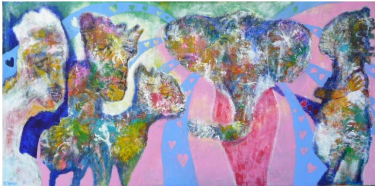
After two months, the completed "Hearts of Cambodia" painting (4' x 8')