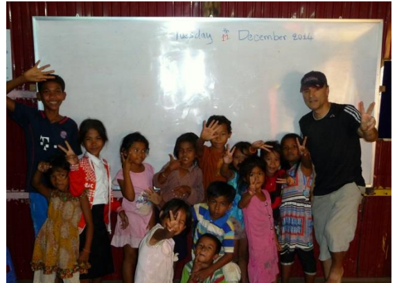
With a class at Samaky village

Samaky village exists on borrowed government land. The poor families (including 200 children) are not permitted to own the land or their dwellings. The budget for art materials was $20. Together we explored many aspects of art .