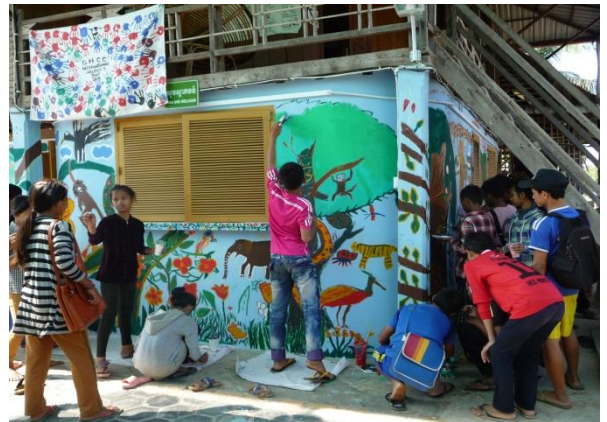
Students painting the Grace House mural